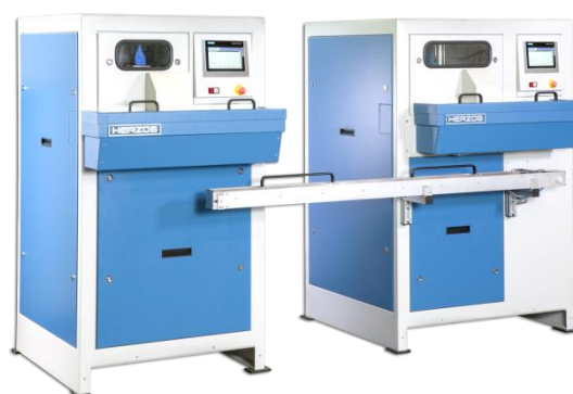
Fig.01: Automatic mill (HP-MA) and the automatic press (HP-PA) for sample preparation in semi- or fully automatic laboratories.