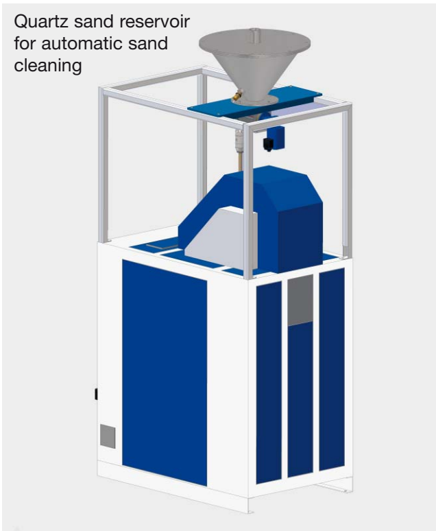
Quartz sand reservoir for automatic sand cleaning

Special features like automatic quartz sand- and compressed air cleaning between samples and the continuous magazine operation of up to 30 samples makes this unique machine suitable for mining and geological laboratories.