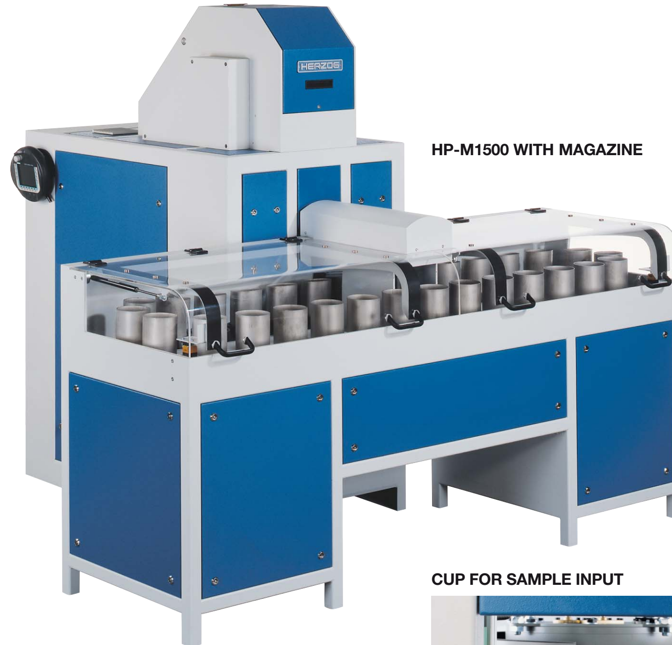
HP-M1500 WITH MAGAZINE